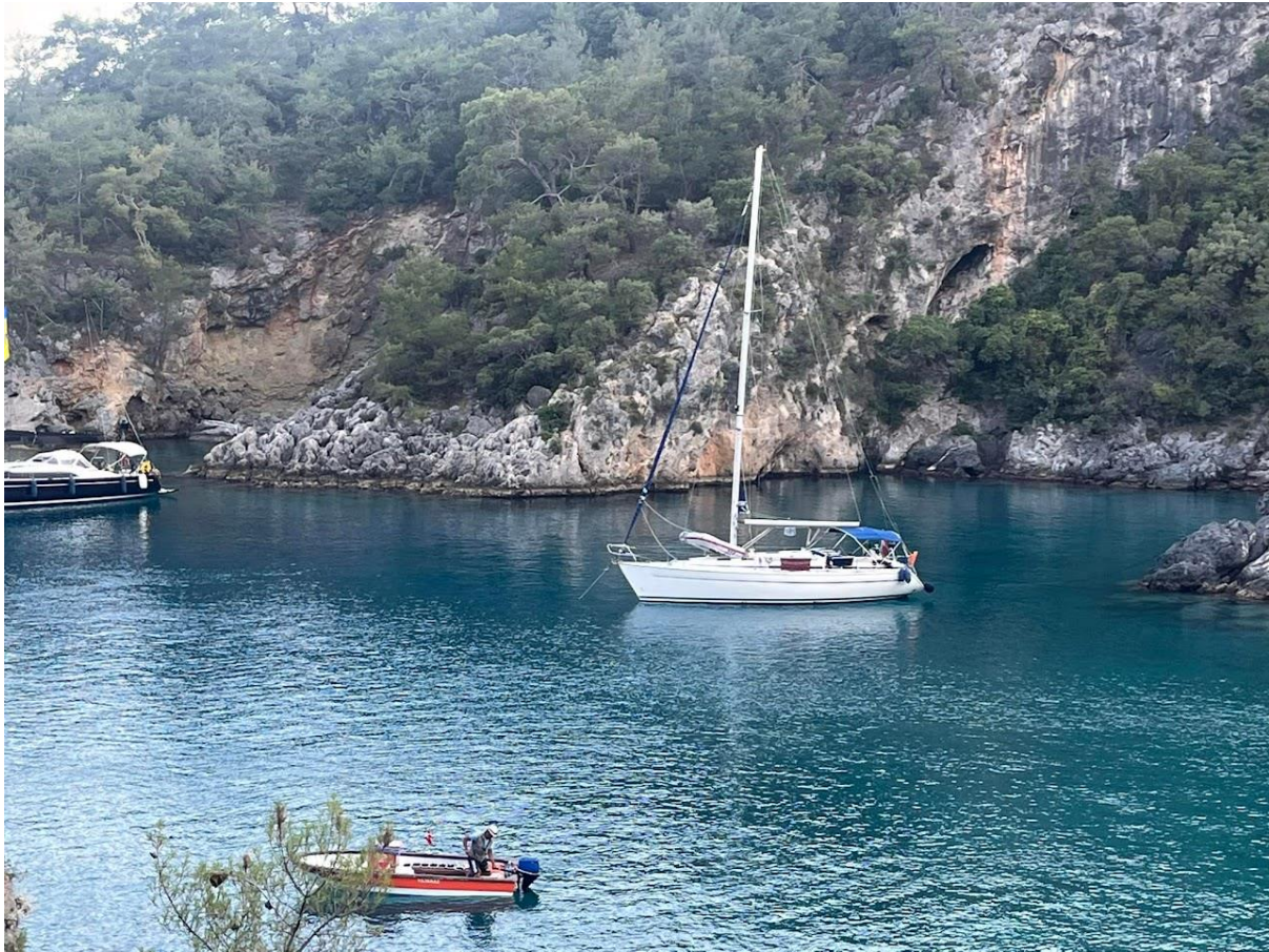
Ploes in Coldwater Bay