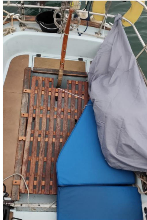
A nice fair-weather berth in the cockpit, using Colin's multi-purpose duckboards.