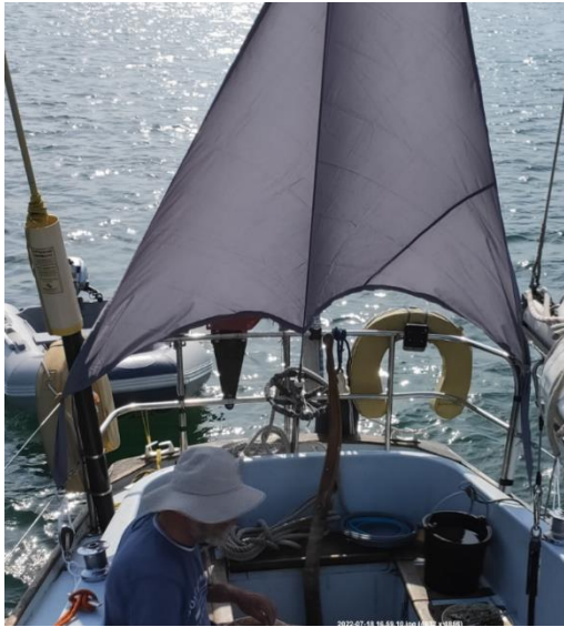
Enjoying fried mackerel under the sunshade.