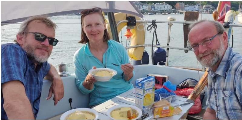
Pudding on Fowey, featuring Cliff's folding table.

One challenge is conquering queasiness. I think the main solutions are: no tea or coffee (just keep water bottle handy); skip breakfast; minimise smells (bilges, maintenance solvents etc.); minimal alcohol night before; keep lunch snacks and sandwiches in handy location for consumption while underway; put on more clothing than you think necessary before leaving port.