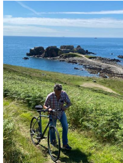
(Round the Island race in July, left, and Alderney during this summer's cruise.)