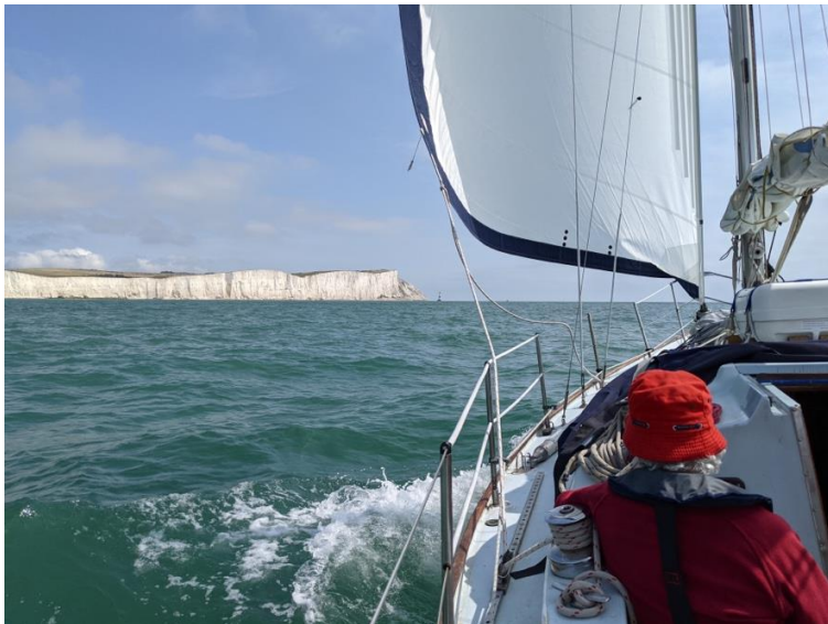
Passing Beachy Head near the end of this summer's cruise, powered by the new genoa.

When back in home waters and sailing in the Harwich approaches, the spinnaker ripped extensively. Investigations showed it to be at least 25 years old and probably much more. Basically, it was clapped out. Chris Jeckells came up trumps and manufactured a new spinnaker out of ends of rolls of fabric at a very advantageous price. The colour scheme is totally abstract and we should get some interesting photos appearing on Facebook!