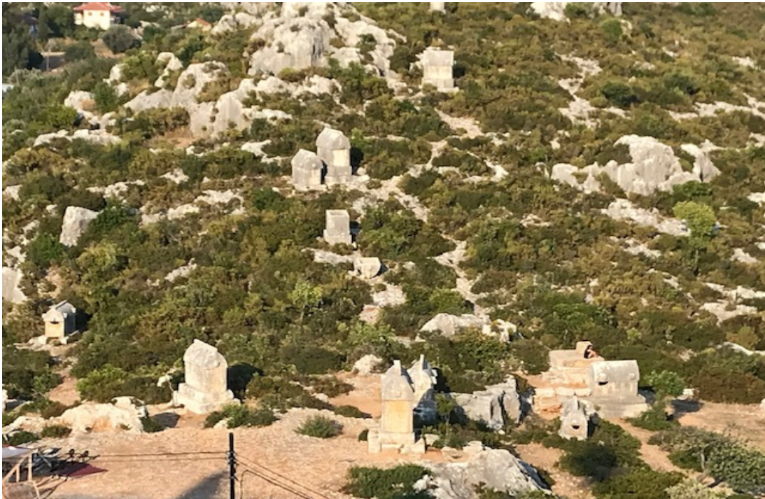
Necropolis at Kalekoy

Overlooking the village is the remains of a castle from which there are magnificent views of the waterways and also a Lycian necropolis with a field of sarcophagi including a sarcophagus sunken in the water just a few feet from our restaurant.