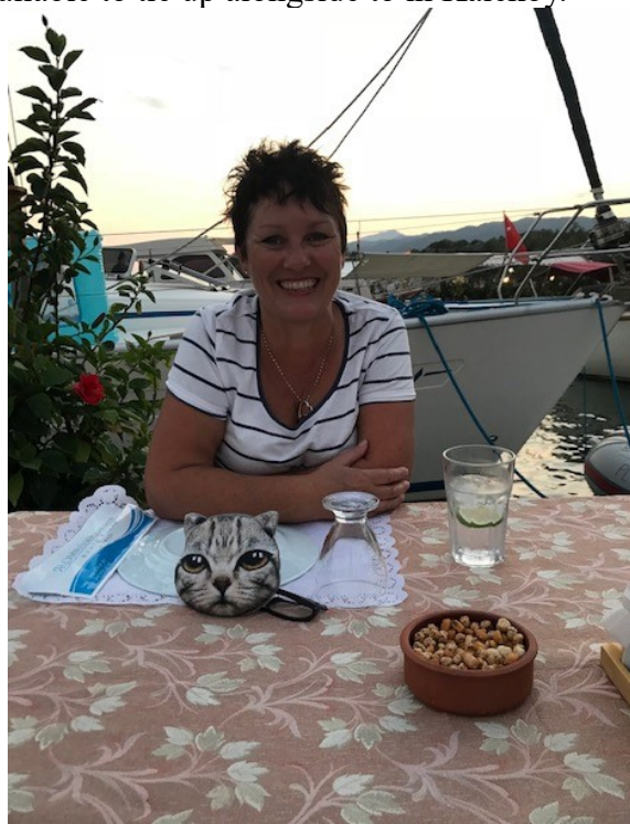
Dining out next to Ploes in Kalekoy

There are three restaurants available to tie up alongside to in Kalekoy.