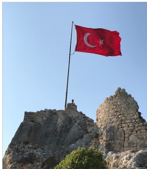
Castle remains at Kalekoy

Early on Friday we motored out of Kas, turning east at the headland, passing the old harbour and bay on our port side and the very nearby-only a kilometre away-Greek island of Kastellorizo to starboard. Avoiding rocks and islets we passed south of Ic Adasi(island) and then north east entering Kekovo Roads through the narrow channel south west of Kara Adasi. Kekovo is a long narrow island south of the mainland. There is a corresponding 1km wide channel of water that runs between the two for 10km. On the mainland side of the channel is yet a smaller stretch of more protected water on which the small town of Ocuadiz lies. Ocuadiz evidently has been spoilt by the addition of a commercial port for day boats so we didn't tie up there. Also on the mainland side of the Roads is situated the small hillside village of Kalekoy.