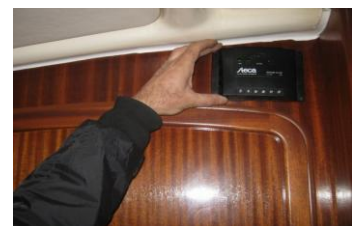
'Ploes's' new solar-panel array and energy management system – fitted December 2013